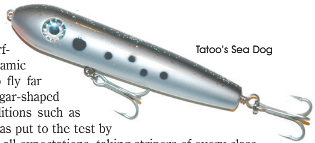
Tatoon's Sea Dog

The new "Sea Dog" from Tatoon's Tackle is sure to become a surfcaster's secret weapon. Because of its hefty size and aerodynamic shape, this 6-inch, 3-ounce topwater plug has the ability to fly far beyond the breakers in even stiff onshore winds. And, its buoyant cigar-shaped body enables it to be effectively worked in more challenging conditions such as strong currents and a relentless chop. Before its release, this plug was put to the test by some of the East Coast's most seasoned surfcasters, and it exceeded all expectations, taking stripers of every class and holding up to countless bluefish attacks. Like all Tatoon's surf plugs, this lure is hand-turned from select hard wood, thru-wired, and rigged with superior components such as extra heavy belly swivels, Wolverine split rings and needle-sharp VMC hooks. The custom multi-coat finishes are also very impressive, anglers can choose from traditional, baitfish or classic series paint schemes. Look for more models from this very talented lure maker coming soon. For more information visit www.tatoostackle.com .